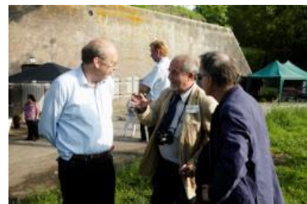
At the Fort Vechten in Utrecht

Next part of this first newsletter we proudly introduce the partners of AT FORT