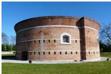
The Maximillian tower in Venice