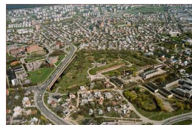
Aerial view of 7th Fort, Kaunas

In the 19th century the development of the city of Kaunas was closely connected to the incorporation of Lithuania into the bureaucratic system of Russian empire. The city gained military importance, becoming one of the main centres of the Russian defensive system. This led to the construction around Kaunas of two rings of military fortresses. The Kaunas fortress complex included over 200 objects of different purpose. It was built during 1882-1889 on the orders of Alexander II. At the beginning of the 20th century, the fortress lost its defensive significance, especially when Lithuania regained its independence. More: http://www.atfort.eu/node/24