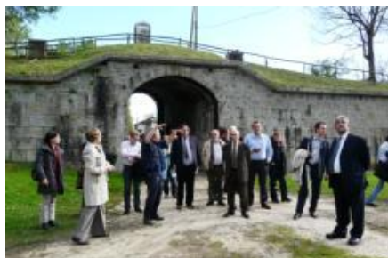
Visiting Fort Carpenedo