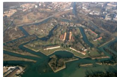
Aerial view of Forte Marghera

From the founding of Venice until 1805 “Malghera” was a thriving village at the end of the lagoon. Its crucial position (at the crossroad between the edge of the lagoon and the line joining Mestre at Venice), forced a military use, and the old quarter was turned into a grand and, for the time, modern fortress, able to keep the enemy fire of cannons away from Venice and to control land access to the city. The end of XIX the fortress defensive ability became insufficient so it was strengthened building a fortress system: the entrenched Camp of Mestre. More: http://www.atfort.eu/node/21