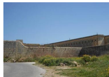
Fortress of Paola

The Corradino Lines, a low defensive line, was constructed by the British Royal Engineers in 1871-72 on the Corradino Heights. More: http://www.atfort.eu/node/27