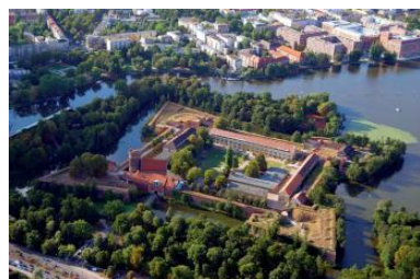
Citadel of Spandau

Work on the Citadel Spandau began in 1560, a modern fortress in the “New Italian Manner” replacing the former castle, whose origins date back to Slavic times. Citadel Spandau is the best preserved renaissance fortress in northern Europe and is now used exclusively for cultural purposes and for recreational and leisure activities. More: http://www.atfort.eu/node/23