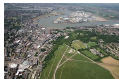
Great Lines heritage park

Kent and Medway have a vast array of defensive heritage sites, including a potential World Heritage Site (Chatham Dockyard and its defence line) and an overwhelming number of individual and ring fortifications, covering a variety of periods, and affected by a range of issues - such as decaying fabric, fragmented ownership, lack of economic purpose, limited community involvement and ecological concerns. More: http://www.atfort.eu/node/29