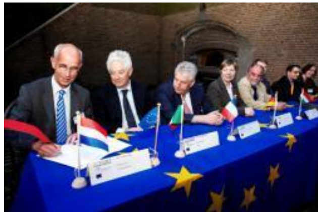
Undersigning the Partnership Agreement

The AT FORT project “Atelier European Fortresses - Powering Local Sustainable Development” is a Regional Initiative Project under the INTERREG IVC programme. The New Dutch Waterline, (The Netherlands), is the lead partner of the AT FORT project. The AT FORT partnership brings together representatives of eleven important European fortified heritage sites who share the firm belief that preservation of these sites, coupled with their economic exploitation, can only be achieved by creative, cooperative thinking, building on an exchange of experiences. On 22 May 2012 the AT FORT partnership Agreement was signed by eight representatives of the eleven “AT FORT partners